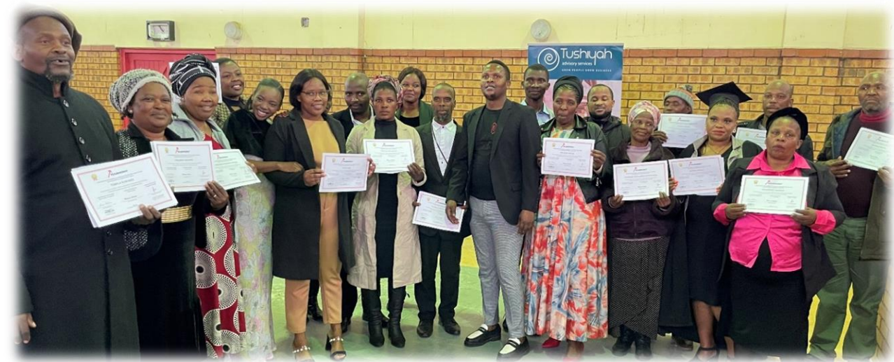
Image 1 Certificate ceremony on June 27th, 2023, at the Emdibanisweni Hall in Ndibanisweni, Tsolo